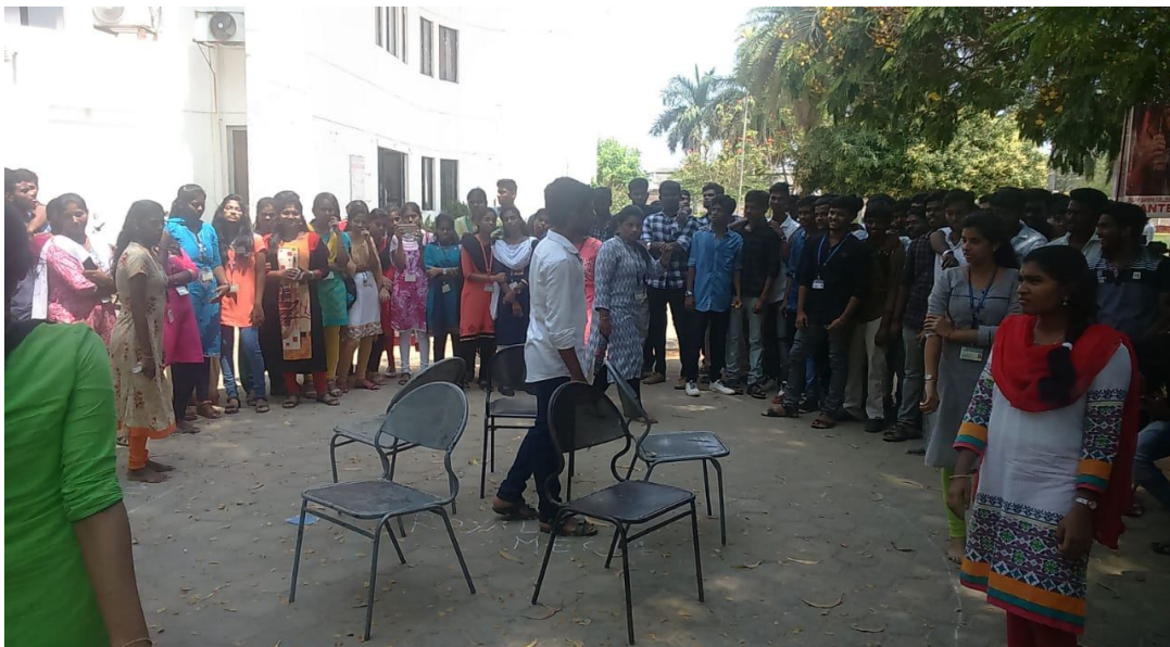
Musical chairs event for women